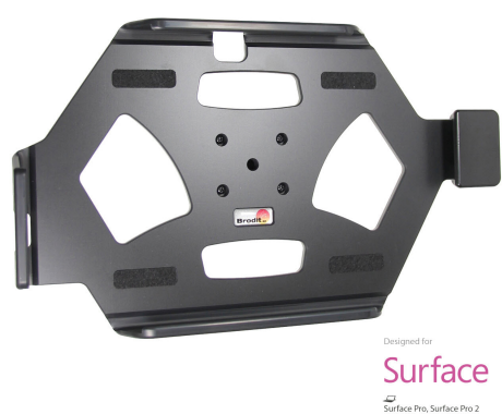
Designed for Surface Surface Pro, Surface Pro 2