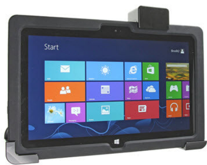
Designed for Surface Surface Pro, Surface Pro 2