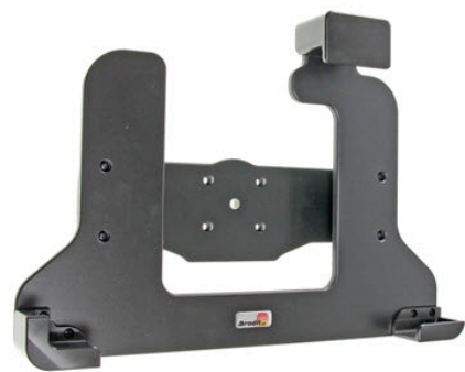
Designed for Surface Surface Pro, Surface Pro 2