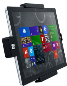
Designed for Surface Surface Pro 3