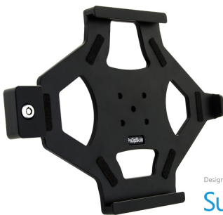
Designed for Surface Surface Pro 3