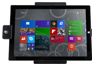
Designed for Surface