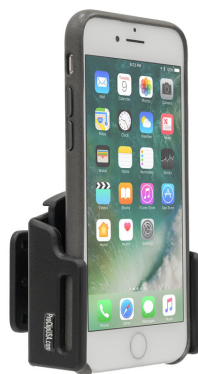
iPhone 6/6s/7/8 with Spigen Slim Armor