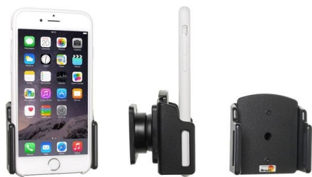
iPhone 6/6s/7/8 with Apple Leather Case