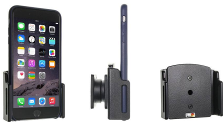
iPhone 11 with Apple Silicone Case