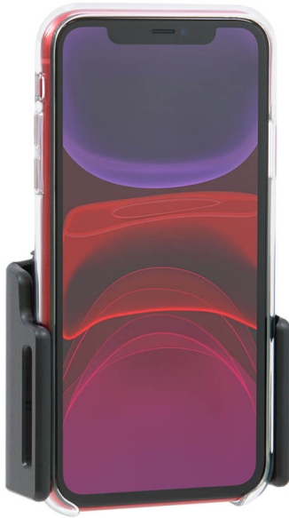
iPhone 11 with Apple Clear Case