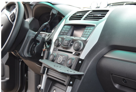
In the box: