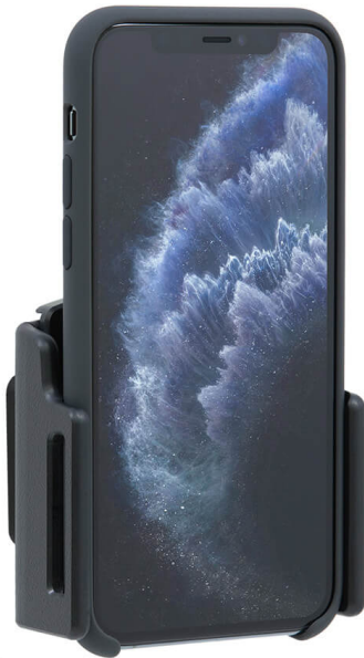
iPhone 11 Pro with Apple Silicone Case