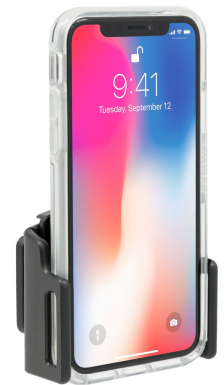
iPhone X with Otterbox Symmetry