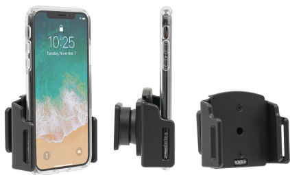
iPhone 11 Pro with Otterbox Symmetry Case