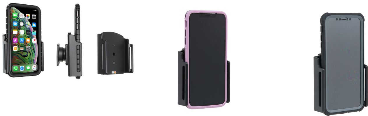
iPhone XS Max with Otterbox Symmetry