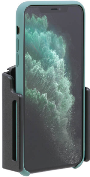
iPhone 11 Pro Max with Apple Silicone Case