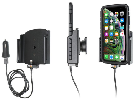
iPhone XS Max with Tech21 Evo Check