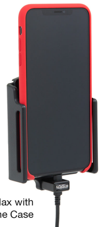
iPhone XS Max with Apple Silicone Case