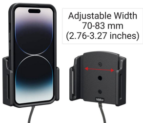
FLEXIBLE SIZING. PERFECT FIT.