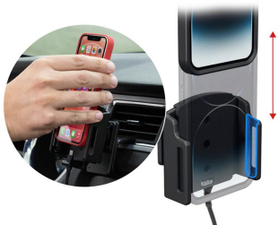
EASY ONE-HANDED DOCKING