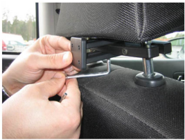
Clamps onto Headrest Post for a Solid Hold