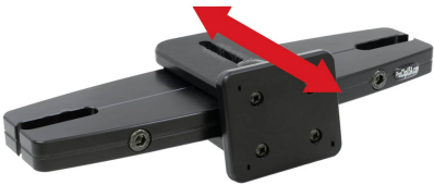
Extends for Optimal Reach