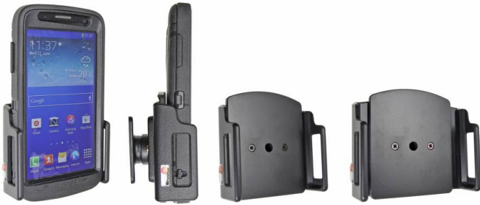
Sample device is shown