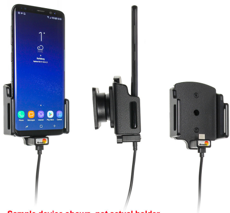
Sample device shown, not actual holder. This holder fits best for device with protective case/skin.