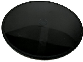
90mm Suction Cup Dashboard Disc

Sold Separately - See "Related Products" or Search for #100642