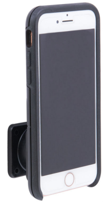
Apple iPhone 8