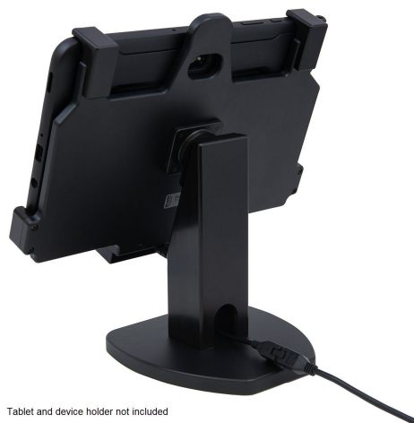
Tablet and device holder not included