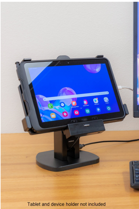
Tablet and device holder not included