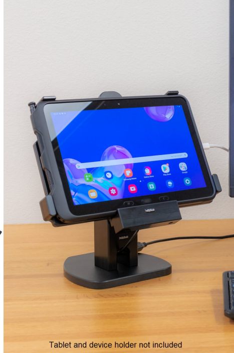
Tablet and device holder not included