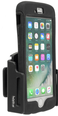
iPhone 6/6s/7 with Griffin Survivor Slim