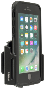
iPhone 6/6s/7 with Lifeproof Fre