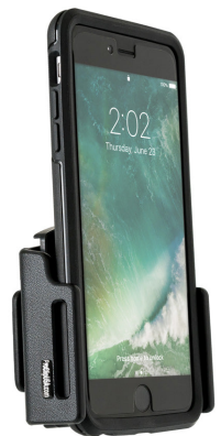
iPhone 6 Plus/6s Plus/7 Plus with Otterbox Symmetry