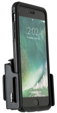
iPhone 6 Plus/6s Plus/7 Plus with Otterbox Symmetry