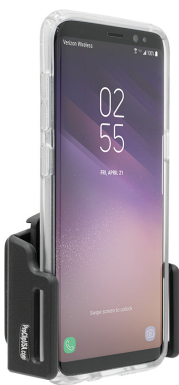
Galaxy S8 with Speck Presidio Clear