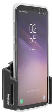
Galaxy S8 with Insignia Soft Shell Clear Case