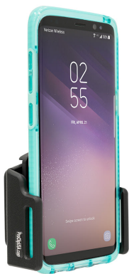
Galaxy S8 with Tech21 Evo Check