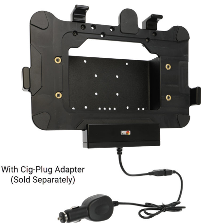
With Cig-Plug Adapter (Sold Separately)