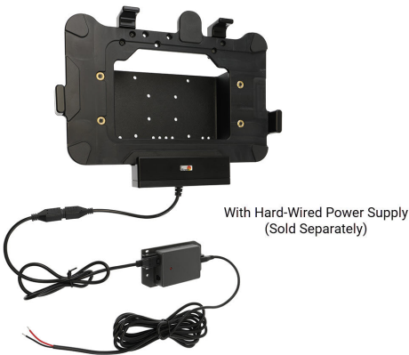
With Hard-Wired Power Supply (Sold Separately)