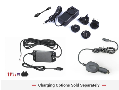
— Charging Options Sold Separately —