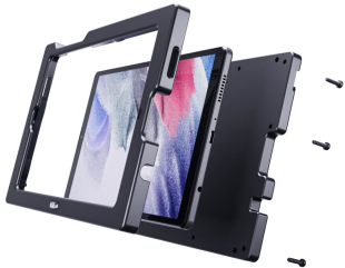
Actual case may vary.