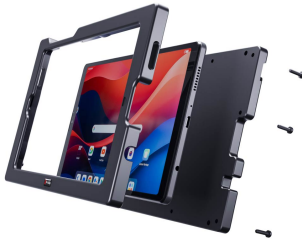
Actual case may vary.